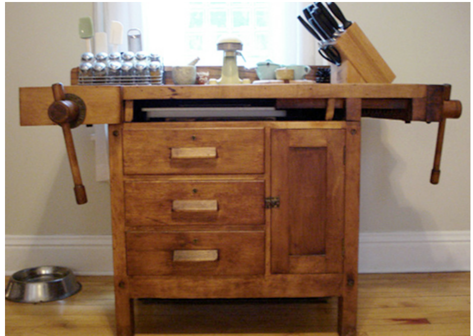
Re-imagined work bench