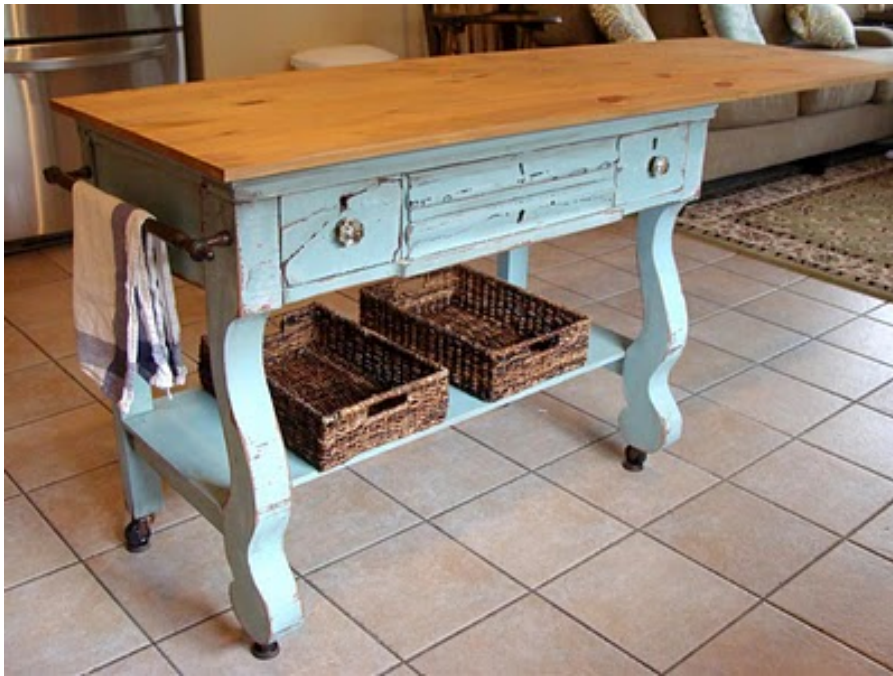
Dressers with Wheels