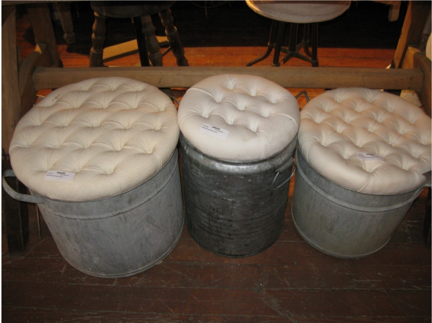
Milk can seating refashioned with tufting that is removable for storage!