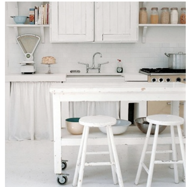
Table tops with lockable casters puts a twist on the conventional Island