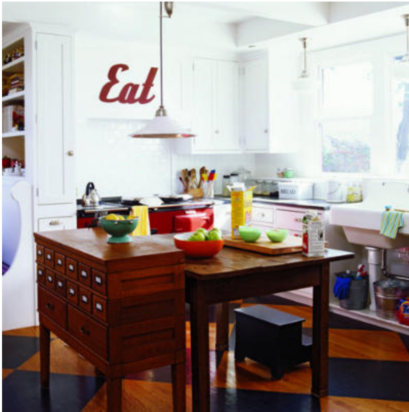
Library card catalogue file