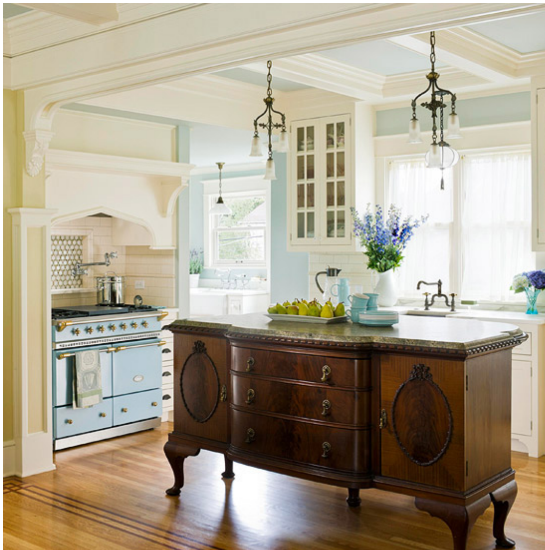
Buffet as Island