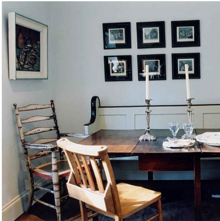
Church Pews as Banquettes